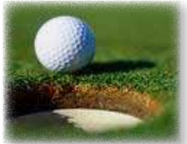
Golf in Williams