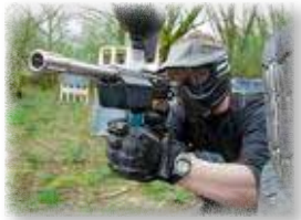
Paintball at Lost Canyon